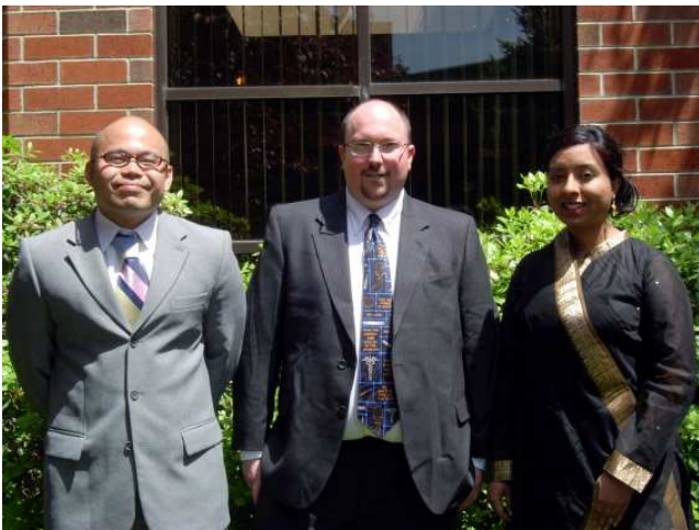
Clinical Fellows 2006