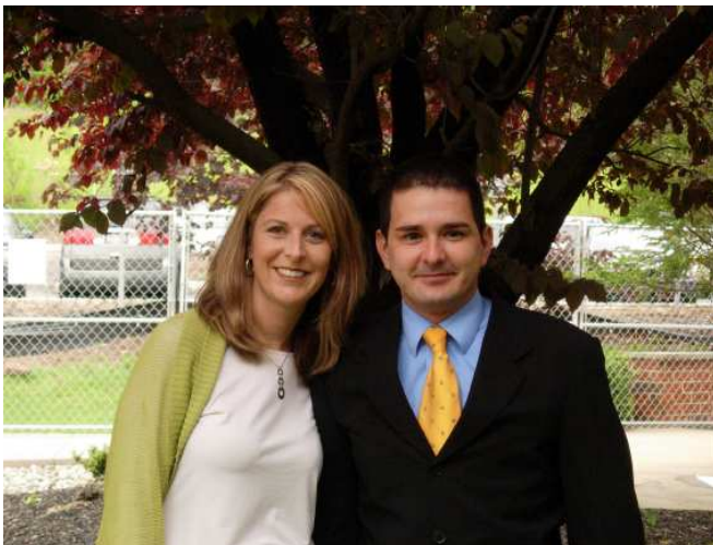
Postdoctoral Fellows 2006